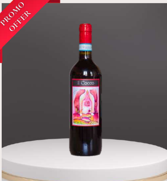
ROSSO DI MONTALCINO