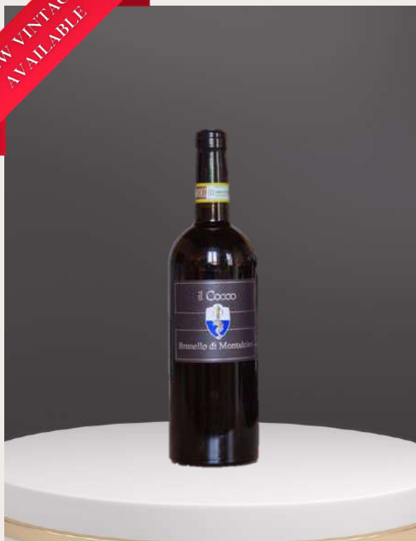
BRUNELLO DI MONTALCINO